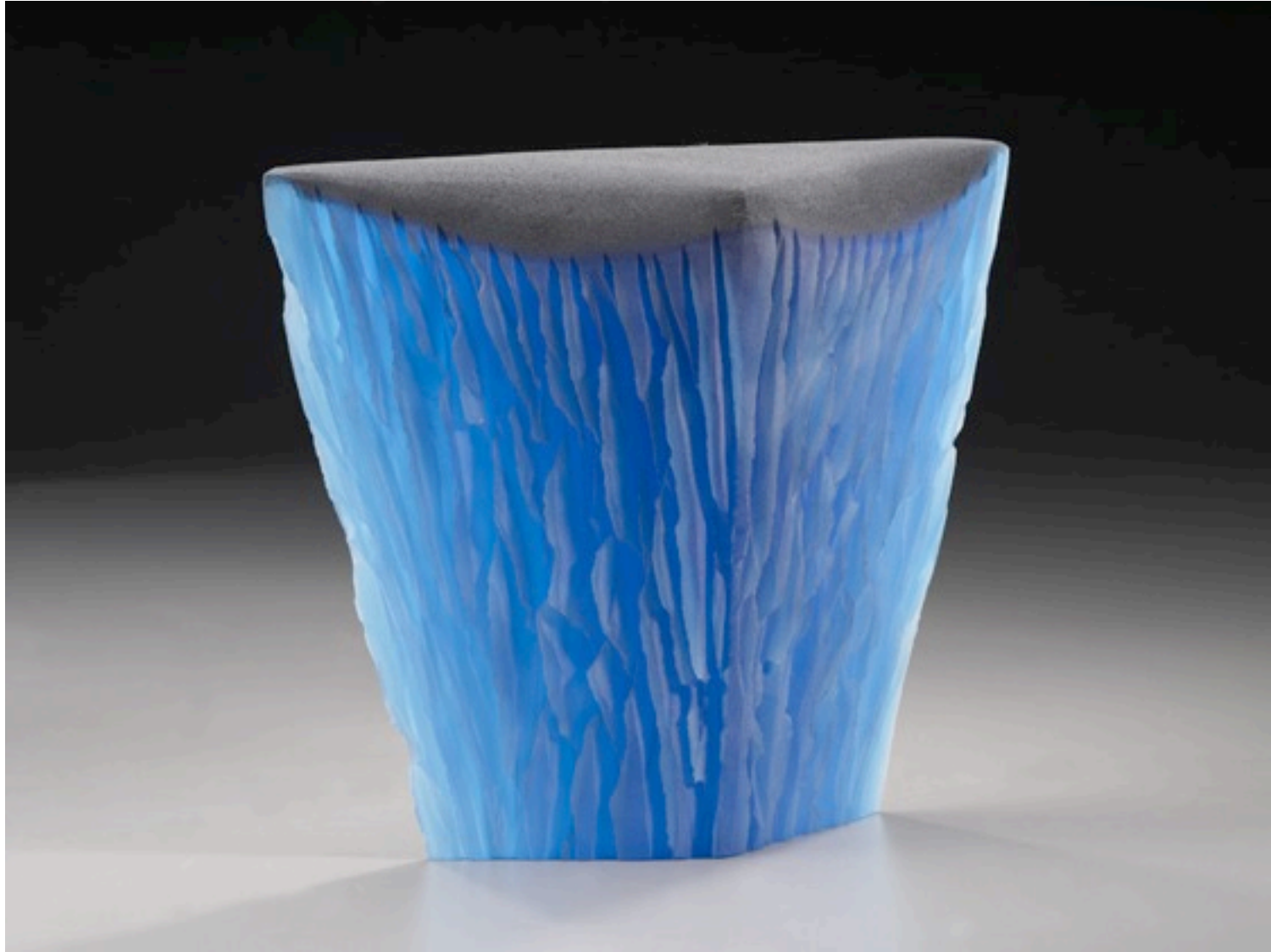
Alex Gabriel Bernstein. Electric Blue Pour (2007). Cast and cut glass, fused steel. 16 x 14 x 3 in.