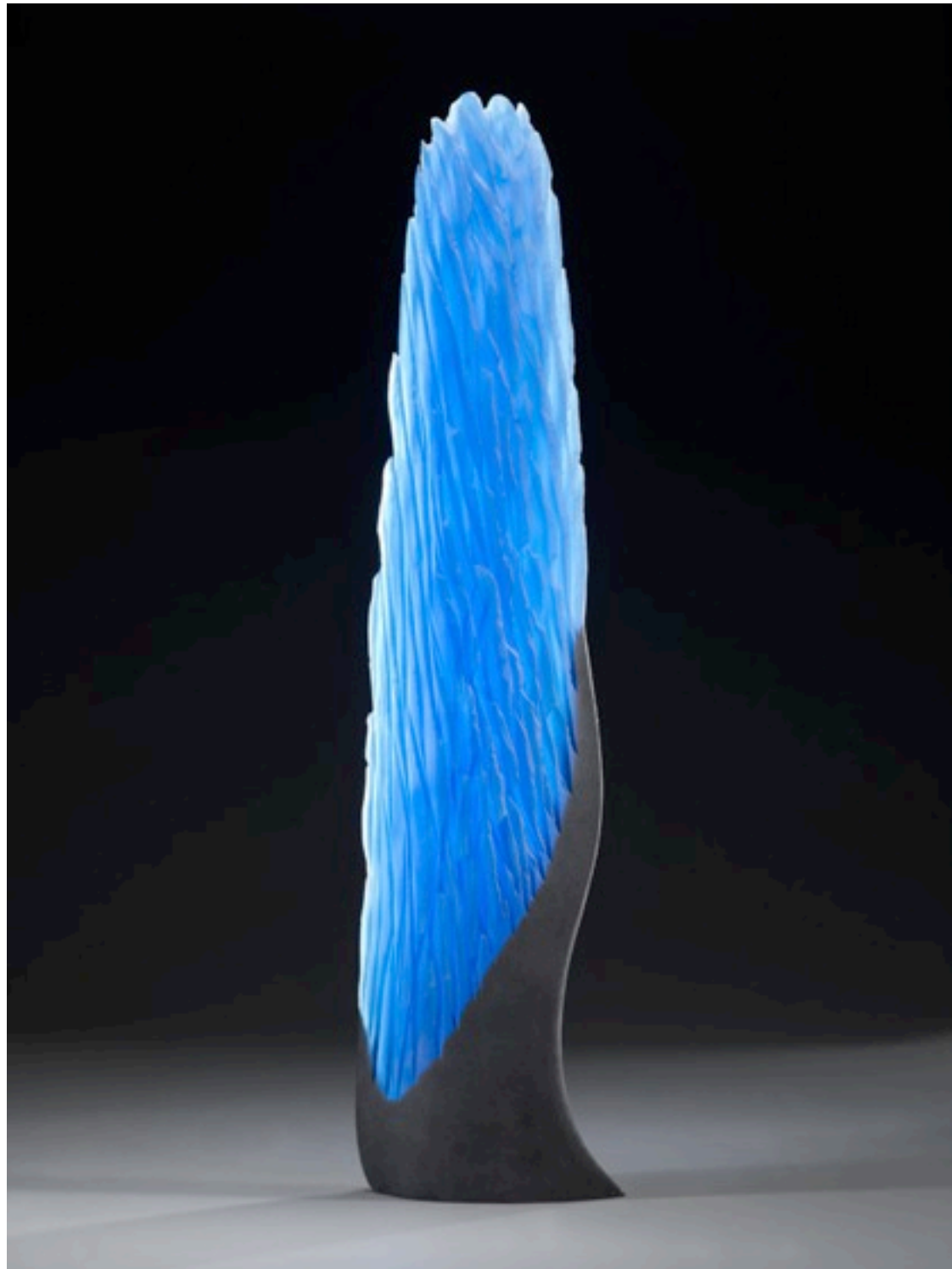
Alex Gabriel Bernstein. Azure Steel Growth (2009) Cast and carved glass, fused steel 36 x 9 x 3 in.